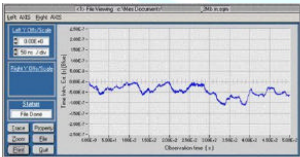
E1 retimed output signal (with a PRC reference clock)